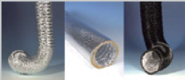
The machine also can be designed for PVC+aluminum duct

Aluminum tube is widely used in the kitchen, bathroom, air condition venting and HVAC system. The stainless steel wire inside can hold the flexible tube in shape and make the tube flexible. The latest aluminum tubeformer can make the quality aluminum flexible duct, and also we can make the insulation for protecting heat.