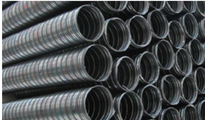
Spiral corrugated tube